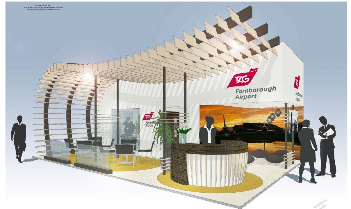
TAG | MEBA 2018 | DUBAI UAE | v04