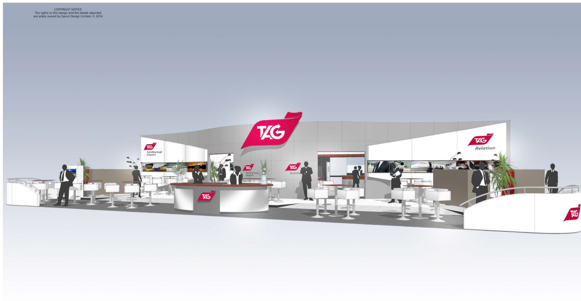
TAG AVIATION | EBACE 2016 | GENEVA | v06